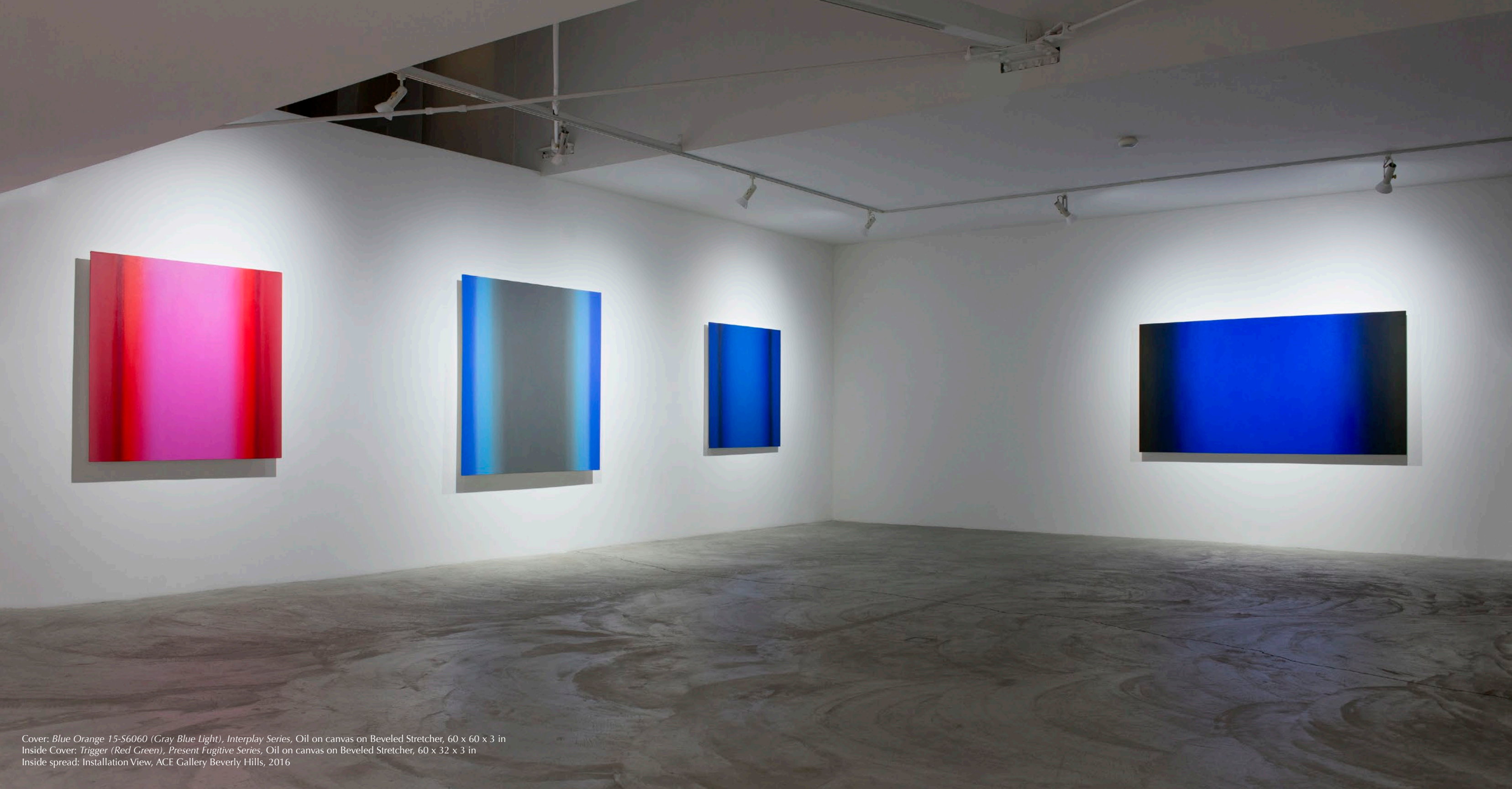
Cover: Blue Orange 15-S6060 (Gray Blue Light) , Interplay Series , Oil on canvas on Beveled Stretcher, 60 x 60 x 3 in Inside Cover: Trigger (Red Green) , Present Fugitive Series , Oil on canvas on Beveled Stretcher, 60 x 32 x 3 in Inside spread: Installation View, ACE Gallery Beverly Hills, 2016